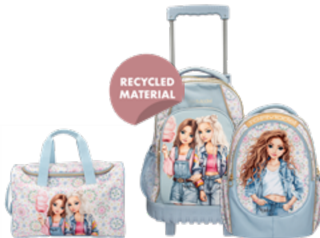
The TOPModel 'Festival Fun' collection is made from recycled PET